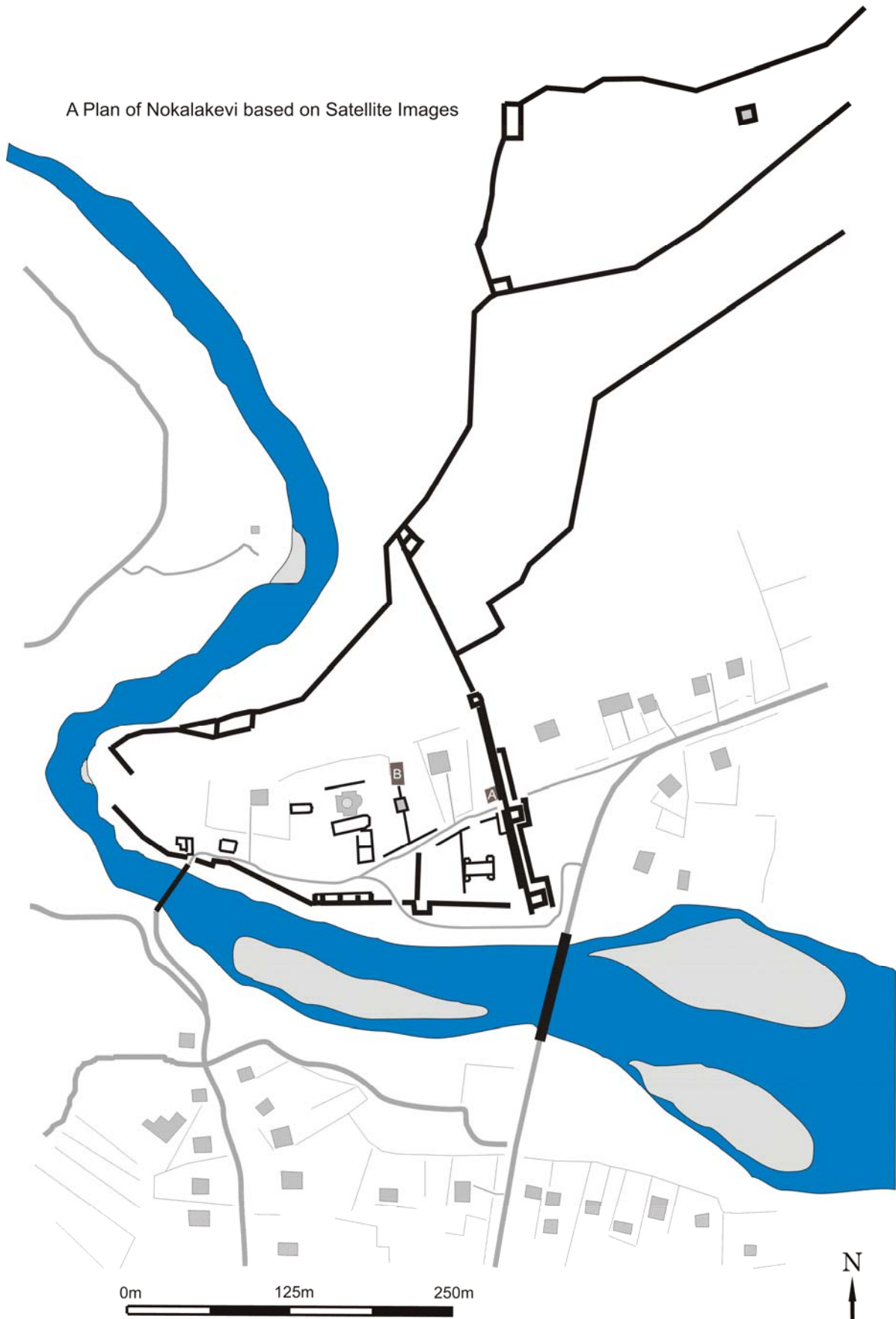
Figure 1: Plan of Nokalakevi showing location of Trench A by the East Gate (drawn by P Everill)